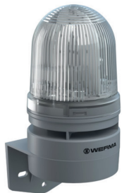
Bracket mounting with cable gland